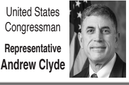
United States Congressman Representative Andrew Clyde

Last month during the final days of the U.S. Supreme Court's 2022-2023 term, our nation received numerous landmark rulings that have profound impacts on the future of our Republic. Given the significance of four crucial decisions, I wanted to share my thoughts on these major judicial wins with you.